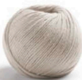
03 Seidengrau Silk Grey