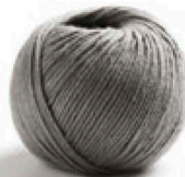
05 Silbergrau Silver Grey