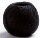
01 Schwarz Black