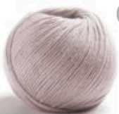
62 Rosenquarz Rose Quartz