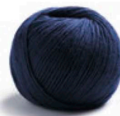
11 Marineblau Navy