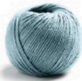
36 Taubenblau Pigeon Blue