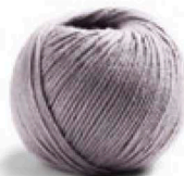
37 Perlgrau Pearl Grey