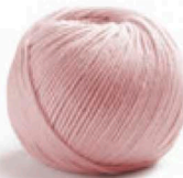
40 Altrosa Antique Pink