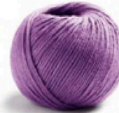
32 Flieder Lilac