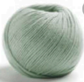
38 Lind Linden Green