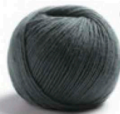
28 Schiefergrau Slate Grey