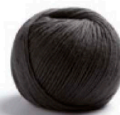
04 Anthrazit Anthracite