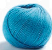
20 Türkis Turquoise