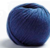
10 Königsblau Royal