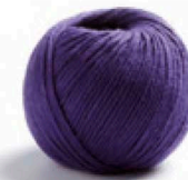
18 Violett Purple