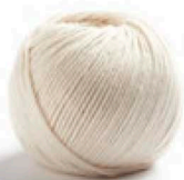
00 Natur Wool White