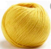
13 Raps Canola