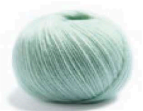
38 Lind Linden Green