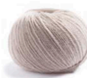
37 Perlgrau Pearl Grey