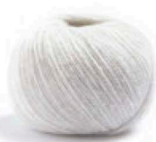
57M Marmor* Marble