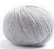
42M Hellgrau* Light Grey