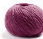
32 Flieder Lilac