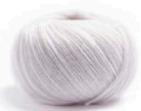
62 Rosenquarz Rose Quartz