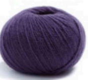
31 Pflaume Plum