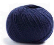
11 Marineblau Navy