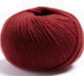
56 Burgund Burgundy