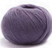
61 Lavendel Lavender