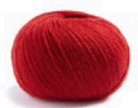
33 Karmin Carmine