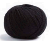
01 Schwarz Black