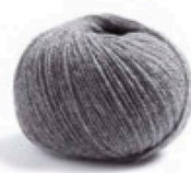
05M Silbergrau* Silver Grey