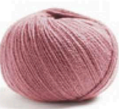
40 Altrosa Antique Pink