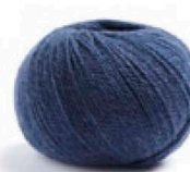
41M Jeansblau* Dark Denim