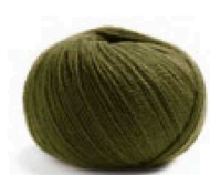
34 Pinie Pine