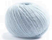
36 Taubenblau Pigeon Blue