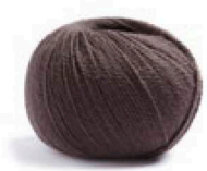
06 Maronenbraun Chestnut Brown