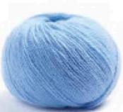
43 Pastellblau Pastel Blue