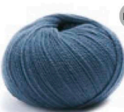
46 Basaltblau Basalt Blue