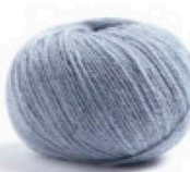
54M Eisblau* Ice Blue