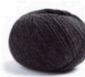
04M Anthrazit* Anthracite