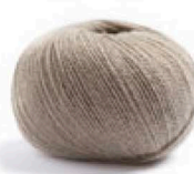
47M Muskat* Muscat