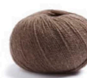
48M Macadamia* Macadamia