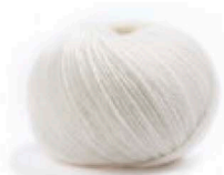
00 Natur Wool White