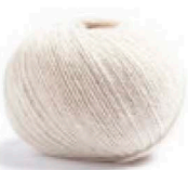
03M Seidengrau* Silk Grey