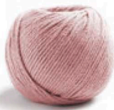
40 Altrosa Antique Pink