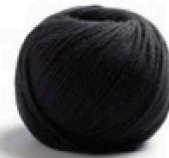
01 Schwarz Black