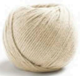
00 Natur Wool White