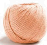
44 Pfirsich Peach