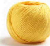
14 Sonnengelb Sunny Yellow