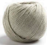
03 Seidengrau Silk Grey