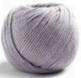
37 Perlgrau Pearl Grey