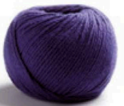
18 Violett Purple