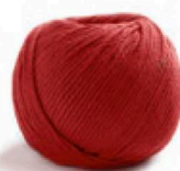
33 Karmin Carmine