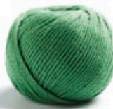
19 Maigrün May Green