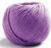
32 Flieder Lilac