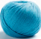
20 Türkis Turquoise