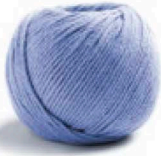
43 Pastellblau Pastel Blue