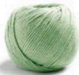
38 Lind Linden Green