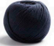
11 Marineblau Navy