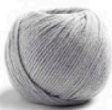
05 Silbergrau Silver Grey