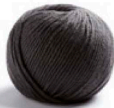
04 Anthrazit Anthracite