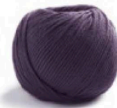
31 Pflaume Plum