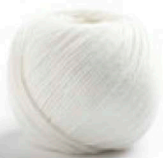
02 Schneeweiß Snow White