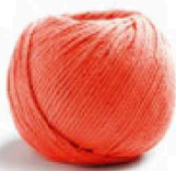
39 Koralle Coral