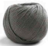
28 Schiefergrau Slate Grey