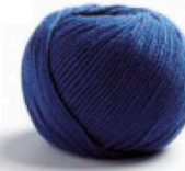
10 Königsblau Royal