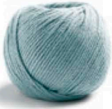
36 Taubenblau Pigeon Blue