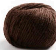
29 Schokolade Chocolate