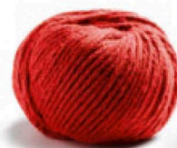
33 Karmin Carmine