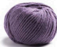
61 Lavendel Lavender