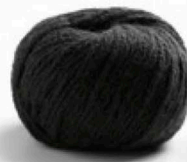
04 Anthrazit Anthracite