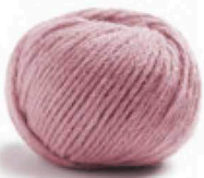
40 Altrosa Antique Pink