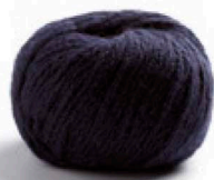
11 Marineblau Navy