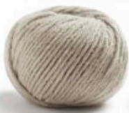
03 Seidengrau Silk Grey