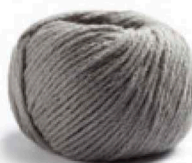
37 Perlgrau Pearl Grey