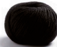
01 Schwarz Black