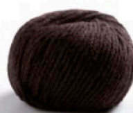
06 Maronenbraun Chestnut Brown