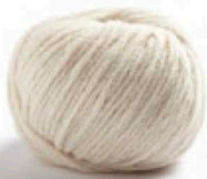
00 Natur Wool White