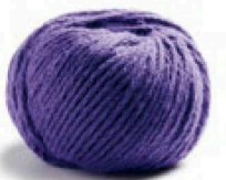
31 Pflaume Plum