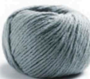
36 Taubenblau Pigeon Blue