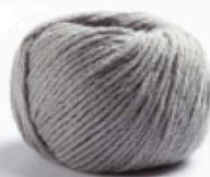
05 Silbergrau Silver Grey