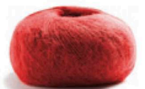
33 Karmin Carmine