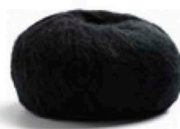
01 Schwarz Black