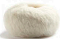
00 Natur Wool White