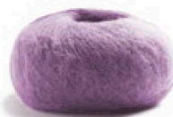
60 Malve Malva