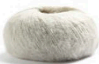
03 Seidengrau Silk Grey