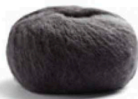
04 Anthrazit Anthracite