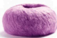
32 Flieder Lilac