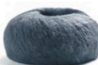
46 Basaltblau Basalt Blue