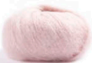
40 Altrosa Antique Pink