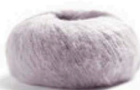
37 Perlgrau Pearl Grey