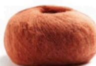
25 Kupfer Copper