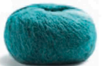
45 Karibikblau Caribbean Blue