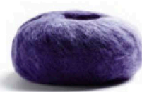
31 Pflaume Plum