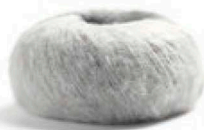
05 Silbergrau Silver Grey