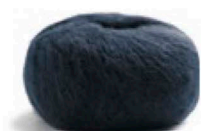
11 Marineblau Navy