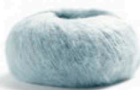
36 Taubenblau Pigeon Blue