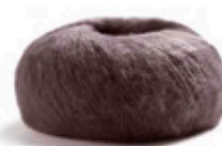
06 Maronenbraun Chestnut Brown