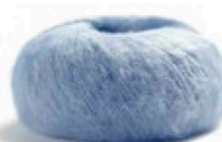
43 Pastellblau Pastel Blue