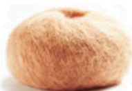
44 Pfirsich Peach